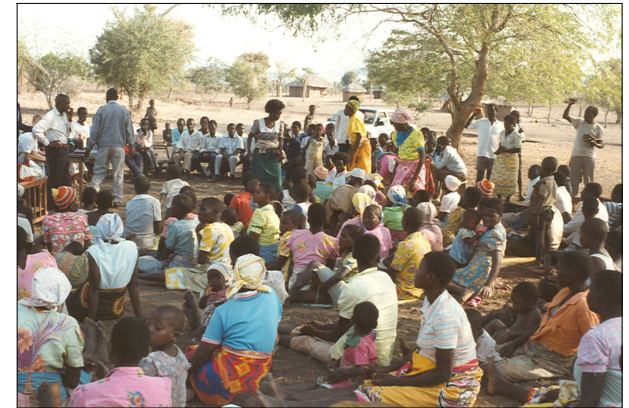
Church Meeting at Nyamdhekha Village

Most churches in Africa are growing very fast, but they lack the spiritual resources to nurture their new believers.